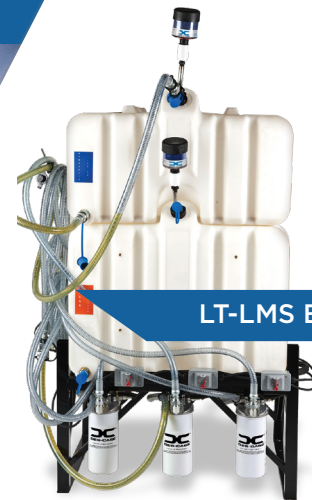
LT-LMS Bulk Storage

CUSTOMER: Xcel Energy INDUSTRY: Natural Gas