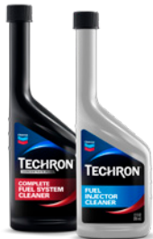
Fuel System Cleaner Techron® Complete Fuel System Cleaner Techron Fuel Injector Cleaner

The product recommendations provide general guidelines for use in passenger cars. All manufacturers have different coolant and lubricant requirements and recommendations. It will be important to contact a Chevron representative or refer to the Original Equipment Manufacturer manual to confirm the proper product is used for the application. You may contact our LUBETEK organization for confirmation of specific equipment OEM specifications.