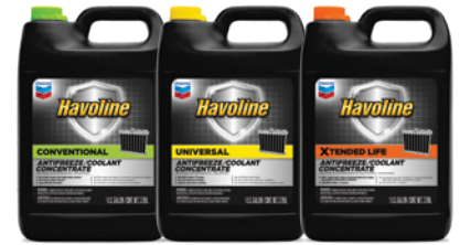
Coolant System Havoline Xtended Life Antifreeze/Coolant Havoline Universal Antifreeze/Coolant Havoline Conventional Antifreeze/Coolant