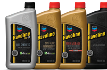
Engine Protection Havoline ProDS® Full Synthetic Motor Oil Havoline Synthetic Blend Motor Oil Havoline High Mileage Motor Oil Havoline Conventional Motor Oil